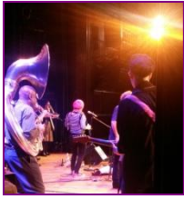
Hazmat Modine returns to the Musical Introduction Series!