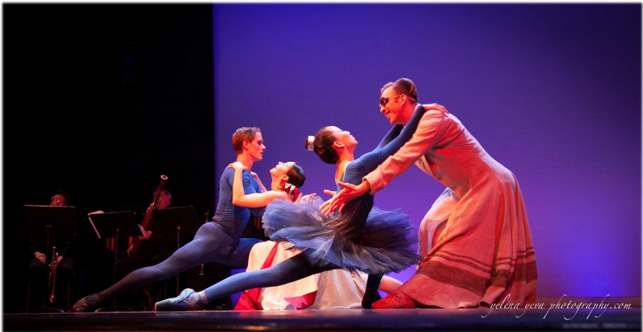
Monsieur Pot, Mademoiselle Moulinette, Madame Lid, and Dish Towel dance a tango through an imaginary French kitchen in La Revue de Cuisine.

With Hazmat Modine, Mona Lisa , and The Kitchen Review