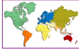
Livestreams continue to provide international access to MIS concerts.