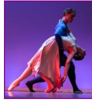
Premieres abound! New York City and World premieres for Unit 3.