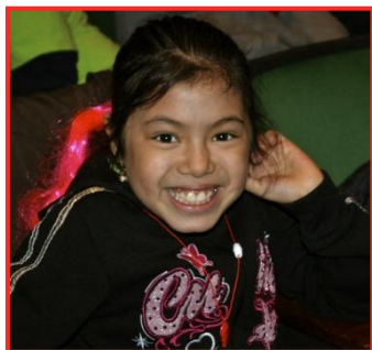
Students were very excited to see Hazmat Modine!

In response to what was most valuable about this unit: “Learning how to sit through a concert, learning what it means to listen and describe what you hear.”