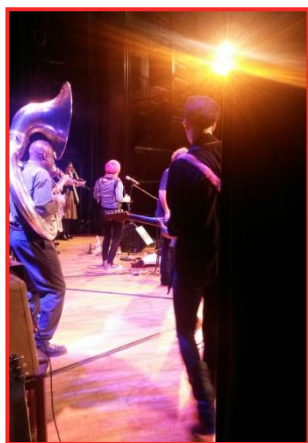
An exclusive backstage peek at Hazmat Modine.

On January 26, people tuned in to watch Hazmat Modine from more than 50 different locations across the globe, with especially high concentration in Germany, where the band frequently tours. On March 30, our presentation of Who Stole the Mona Lisa? and La Revue de Cuisine garnered 235 views from people watching in over half of the 50 states and 28 countries, from Brazil to Russia, Iraq, Malaysia, and Nigeria. It is an incredible opportunity and honor for us to have the ability to share our world music concert series directly with people in the countries whose music our students are studying.